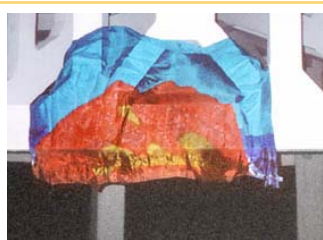
I felt led to drive to Cadiz - one of the Southernmost cities in Spain and dip a banner into the Atlantic Ocean and make some declarations. The wind is holding the (wet) "Faithfulness" banner against some piers on the beach!

around the square. The Cathedral is one of three strategic sites threatened by terrorists after the Madrid bombings!