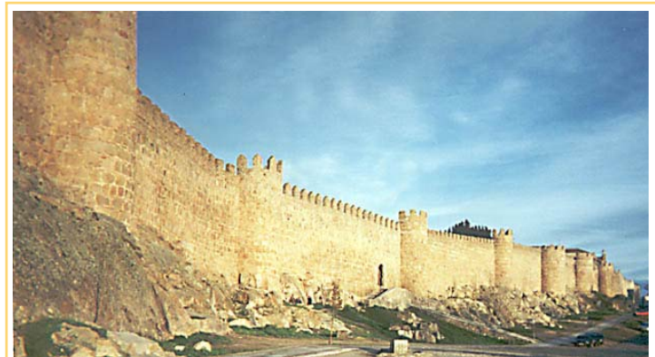
He has placed watchmen on your walls... Spain is a country rich in heritage. This is the wall of Avila. St Theresa of Avila, their patron saint was a Godly woman, probably born again. Can you join me in August to stand on Spain's walls and declare Jesus Lord?

Do you have a banner story or a story of your banner? Do you know somebody who has a good banner story? I would love to hear from you.