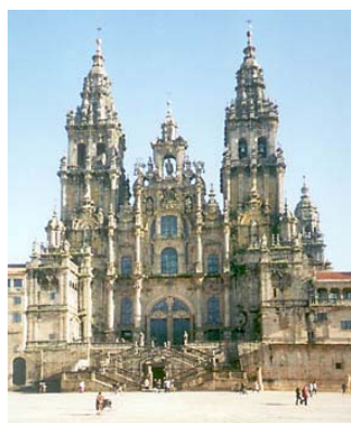
The cathedral at Santiago de Compostella. This is the plaza we will be worshipping in on August 14, 2004. I have a vision of 50 Spanish men warring in worship together with hundreds of other banners - Join us!

The organisers have been waiting for approval to use the Plaza del Obradoiro promised to them over 12 months ago. While I was there I walked around the plaza and anointing all the buildings and corners with oil. A policeman came up to see what I had in my hand and followed my movement all